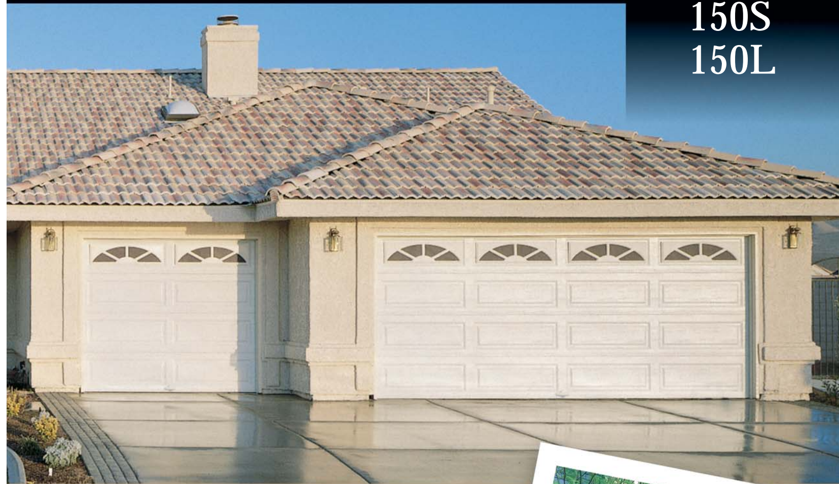
Model 150L Long Traditional Panel with Optional Sunset 601 Window Design

At Clopay, we're building the next generation of garage doors with a patented, finger-protection design that is unlike any other garage door on the market today. This innovative design helps make our doors the safest on the market; however, that's just the beginning. We've added even more details that continue the long Clopay tradition of building garage doors that are beautiful, reliable and durable, and we back it with an extended hardware warranty. Our next generation Value Series offers more than any other garage door in its class. That's why we're right at home...on your home.