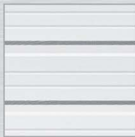
Ribbed Panel Design

Panels are pre-painted inside and out to inhibit rust. Hot-dipped, galvanized steel is painted with primer and given a tough oven-baked polyester top coat, to provide the most rust-resistant steel door available. Ten year warranty against rust-through.