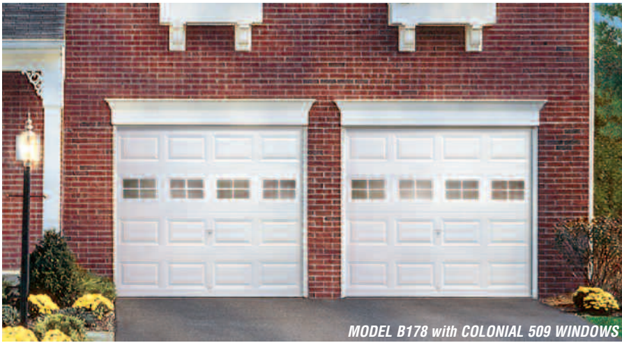
MODEL B178 with COLONIAL 509 WINDOWS