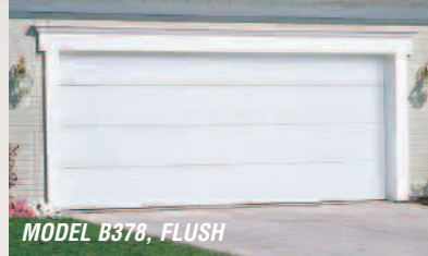
MODEL B378, FLUSH