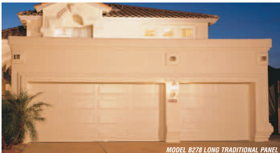
MODEL B278 LONG TRADITIONAL PANEL