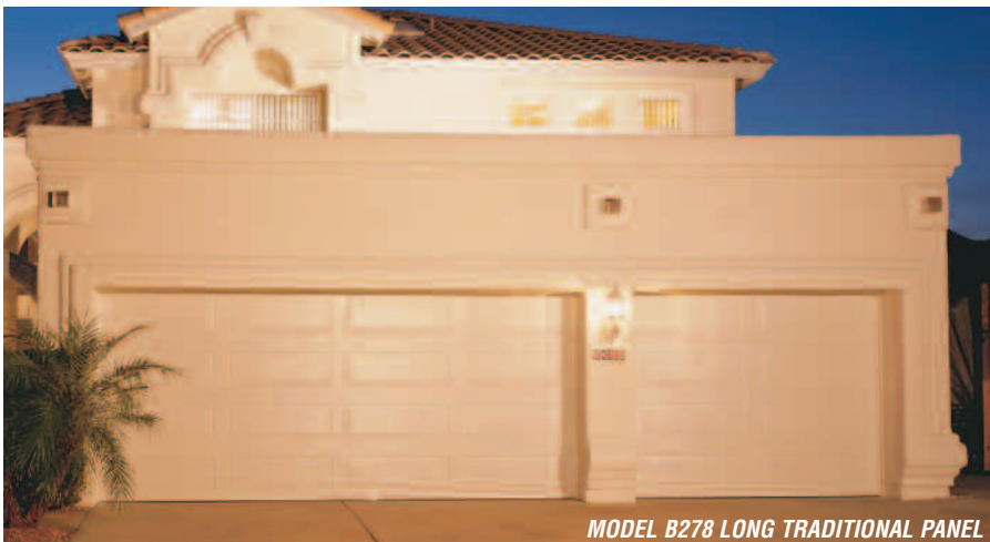
MODEL B278 LONG TRADITIONAL PANEL