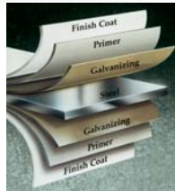
Unsurpassed Rustproofing System