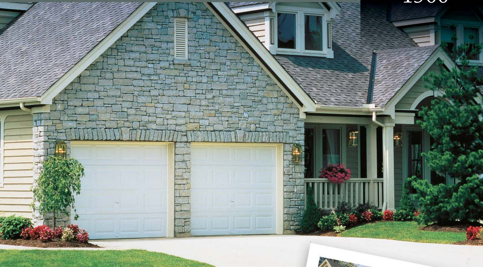
Model 1500 Short Traditional Panel Design

With a 2-layer construction, including a full 1 5/16 " thick polystyrene insulation, the Model 1500 is built to be energy-efficient, durable and quiet. Combined with four color options and a beautiful traditional panel, it will be sure to complement your home's style.