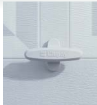
Step Plate/ Lift Handle