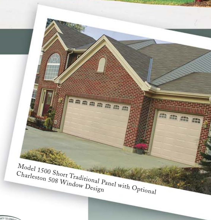
Model 1500 Short Traditional Panel with Optional Charleston 508 Window Design

With a 2-layer construction, including a full 1 5/16 " thick polystyrene insulation, the Model 1500 is built to be energy-efficient, durable and quiet. Combined with four color options and a beautiful traditional panel, it will be sure to complement your home's style.