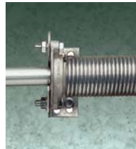
Galvanized Torsion Spring